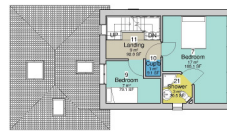
01 First Floor 1:100