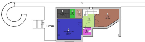
00 Ground Floor 2.2m cut plane 1:100

Ramp for disabled access and to assist the village in times of flood by creating a safe refuge in the village centre