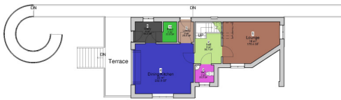
01 Ground Floor 1:100

Ramp for disabled access and to assist the village in times of flood by creating a safe refuge in the village centre